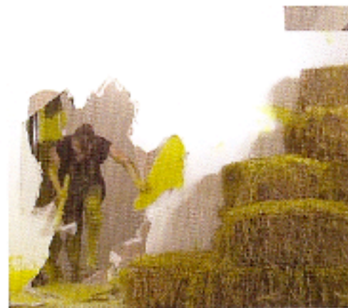
Come Around , 2009. Video still.