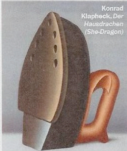
Konrad Klapheck, Der Hausdrachen (She-Dragon)